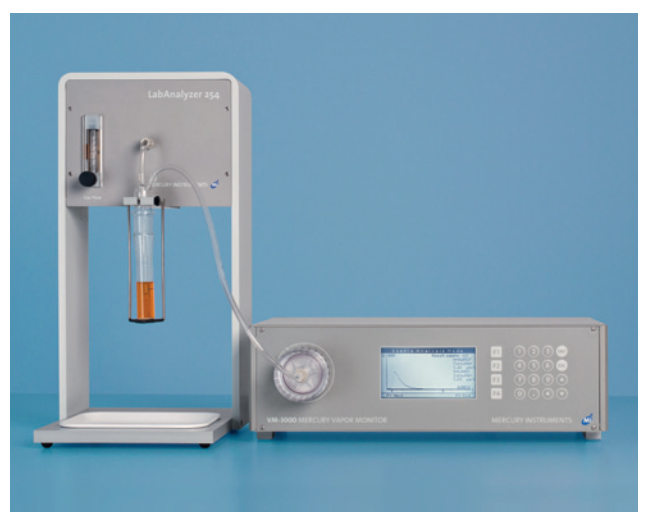
Compact und quick: LabAnalyzer 254 with reaction unit (left) and photometer (right)

In contrast to a typical multi element AAS as often used in laboratories the LabAnalyzer 254 is specially designed for mercury determination. This allows top