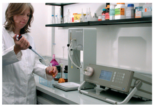
Easy to operate: LabAnalyzer 254, the preferred system for many laboratories world-wide

During the measurement the measuring signal is continuously displayed on the screen. An acoustic alarm is activated to indicate the end of the measurement. In addition to the measurement signal graph, the peak value and the mercury concentration in µg/l are indicated. For samples which are diluted prior to analysis a dilution factor can be entered.